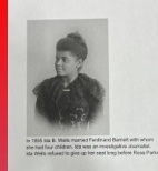
Ida B. Wells