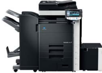
KONICA MINOLTA bizhub C452