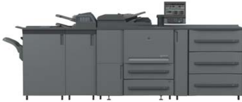
KONICA MINOLTA bizhub PRO 1051