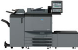
KONICA MINOLTA bizhub PRO C5501