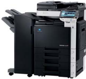
KONICA MINOLTA bizhub C280