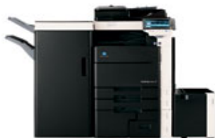
KONICA MINOLTA bizhub C552