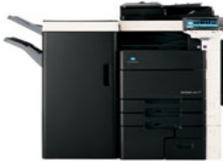
KONICA MINOLTA bizhub C652