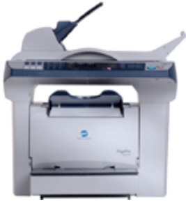
KONICA MINOLTA PagePro 1390MF