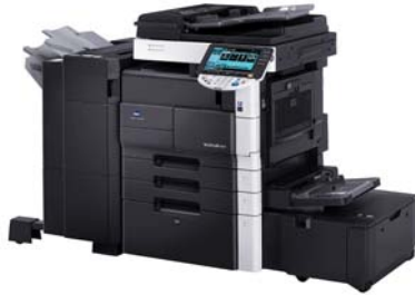
KONICA MINOLTA bizhub 501