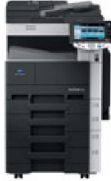
KONICA MINOLTA bizhub 283